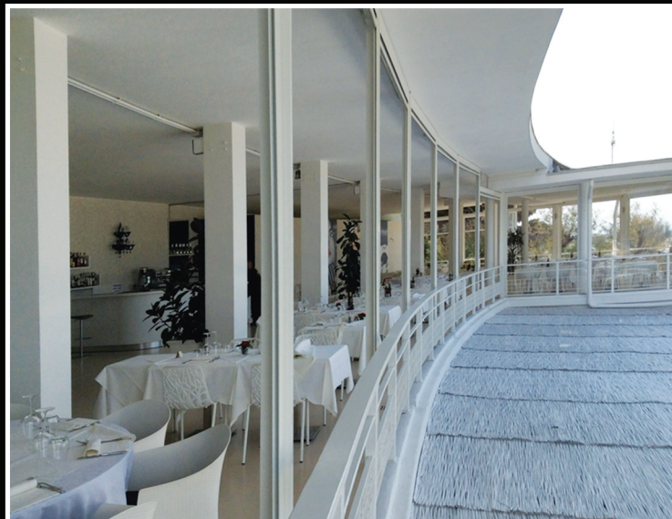
TechnoShield in “Up Position”