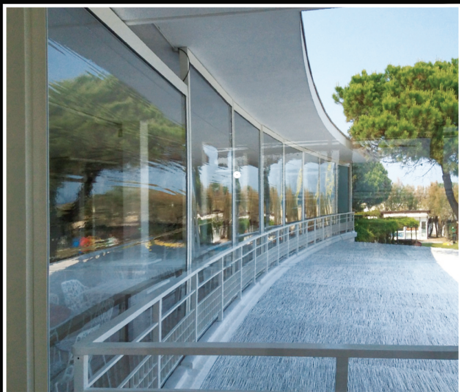
TechnoShield in “Down Position”

Ideal for open areas in Restaurants, Pubs and Verandas where “Wind” and “Rain” protection is required to take advantage of open areas. TechnoTrans are designed to be integrated within large-scale applications, for both retrofit and new constructions projects. It is the ultimate “Wind & Water” Protection solution for large and oversized openings.