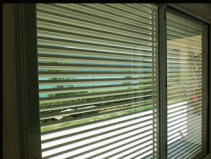
TechnoFlip In Open Position